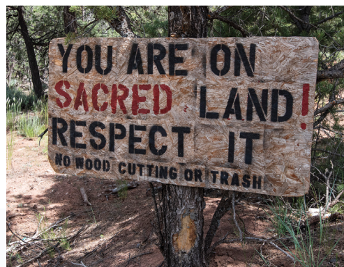
Sacred land sign on a land reuse site in Northern Arizona (Lloyd DeGrane, 2019).