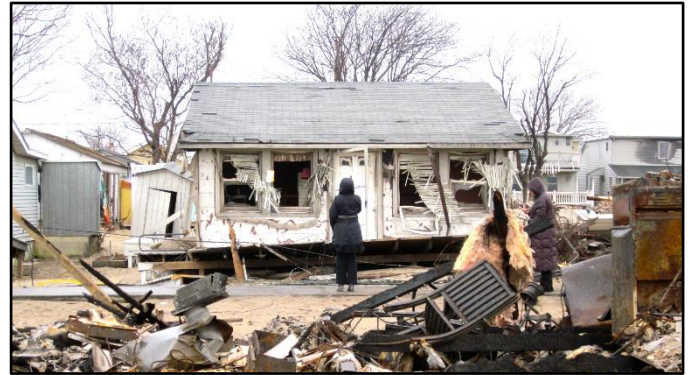
Hurricane Sandy - Breezy Point, NY

Social vulnerability refers to the demographic and socioeconomic factors that contribute to communities being more adversely affected by public health emergencies and other external hazards and stressors that cause disease and injury. Factors such as poverty, lack of access to transportation, and crowded housing may weaken a community's ability to respond and adapt to public health emergencies.