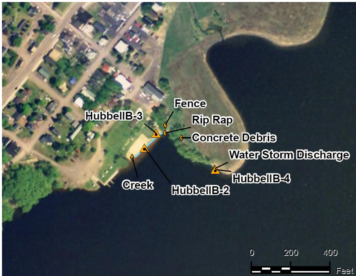
Figure D-2: Map of the Hubbell Beach and slag dump area (Weston 2007A). HubbellB-2, -3, and -4 are sample locations.