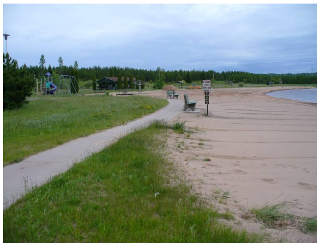
Figure 2: Beach area at the Lake Linden Village Park, picture taken July 2008.

c = The comparison value is the ATSDR chronic environmental media evaluation guide for a child.