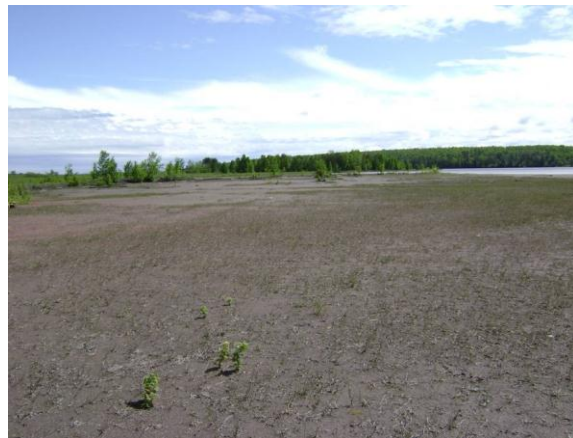
Figure 5: Expanse of exposed stampsand at Mason, picture taken 2008.