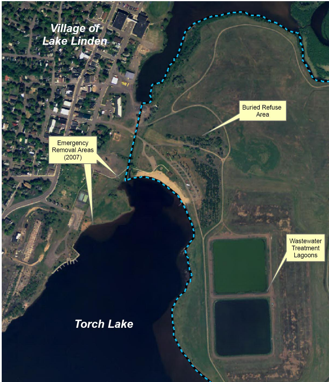
Figure D-1: Map of the Lake Linden area (MDEQ 2009A).