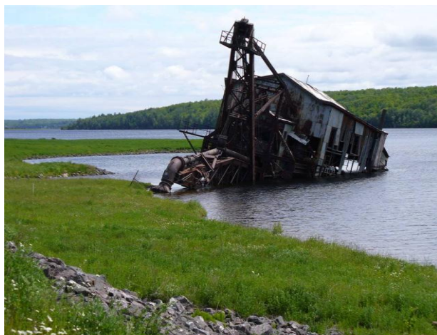
Figure 6: Partially sunken Calumet and Hecla/Quincy Reclaiming Sand Dredge at Mason, picture taken July 2008 (MDCH).

The Mason stampsands area includes structures from historical mining activities. In Torch Lake, just offshore is a sand dredge (Calumet and Hecla/Quincy Reclaiming Sand Dredge). See Figure 6. It is a state registered historical site (state registered historical site number P23275). Visitors and residents are allowed access to this location, and graffiti is on many visible areas and interior walls of the dredge (S. Baker, MDEQ, personal communication, 2012). Ruins of a building are present near the shore and are used for recreational activities, such as paintball (Figure 7). For further information on physical hazards present at this location and the Torch Lake Superfund site, please review the "Physical Hazards in the Torch Lake Superfund Site and Surrounding Area" public health assessment (ATSDR 2012).