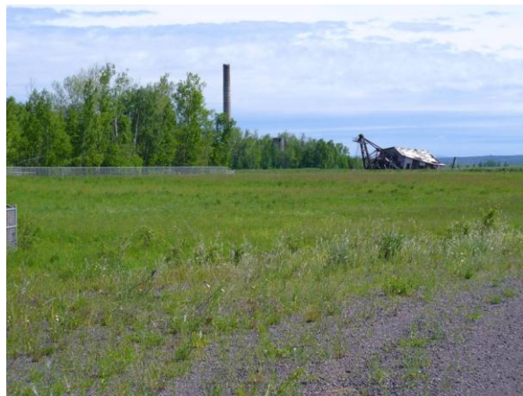
Figure 4: Expanse of partial vegetative cover toward the dredge at Mason, picture taken July 2008.

No PCBs were detected. Table 5 presents the maximum levels of inorganic chemicals without or over the site-specific screening levels or comparison values. (See Table C-5 in Appendix C for the full list of chemicals measured during this sampling.) Figure 4 and 5 are of the expanse of the stampsand at Mason. Locations included in this area were the Mason Area Ruins, Mason Sands, and Tamarack Sands.