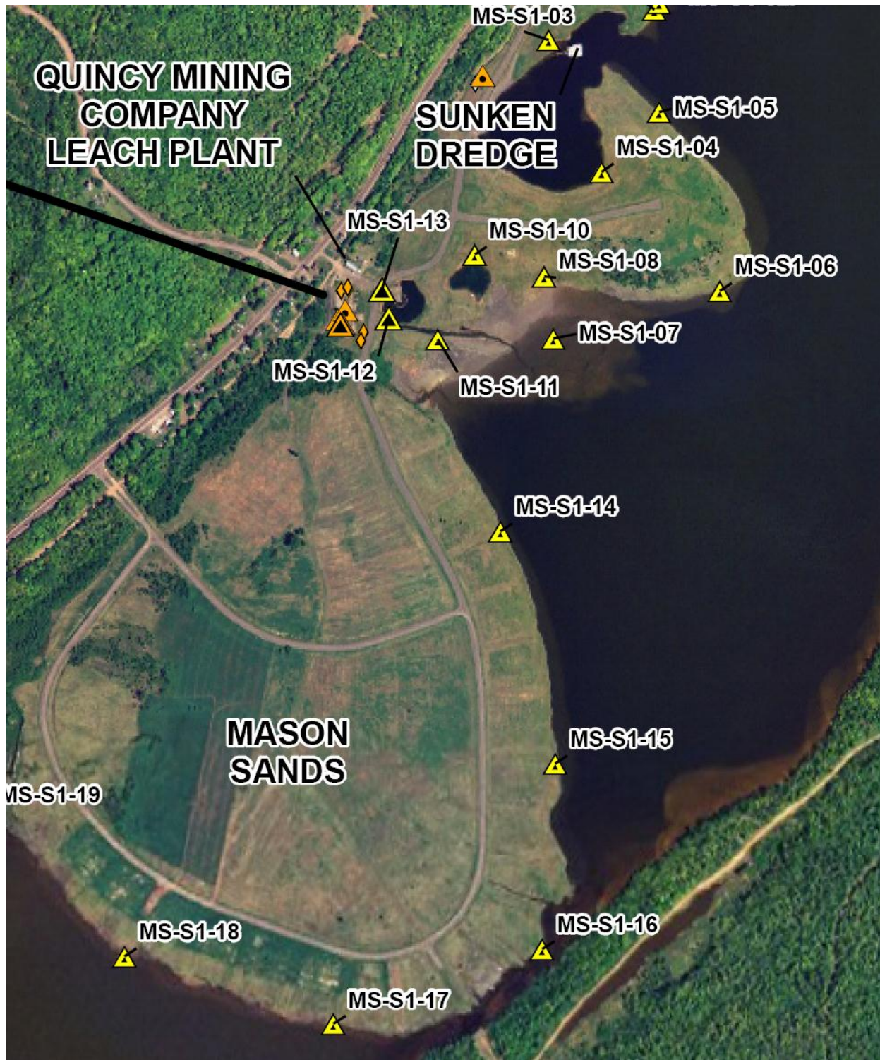
Figure D-3: Map of the Mason stampsands area (Weston 2007A). Triangles with MS-S1-XX are sample locations.