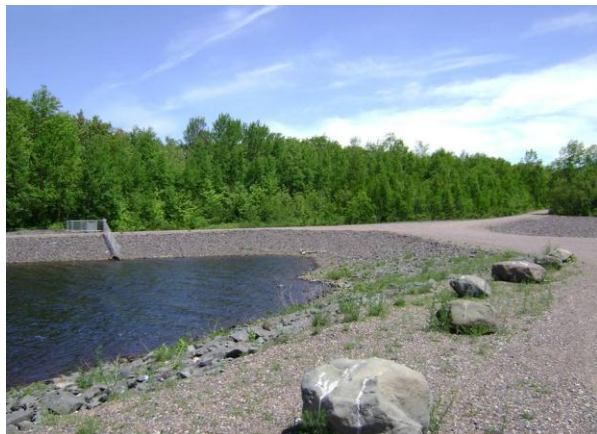
Figure 8: Boston Pond and driveway entry, picture taken July 2008.

Figure 8 shows a portion of Boston Pond and the access from the road, while Figure 9 shows the parking area for Calumet Lake. Table 6 presents the maximum levels of inorganic chemicals from both Boston Pond and Calumet Lake sampling over the site-specific screening levels or comparison values. (See Table C-6 in Appendix C for the full list of chemicals measured.)