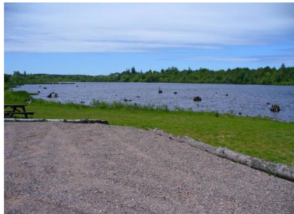
Figure 9: Calumet Lake and parking area, picture taken July 2008.