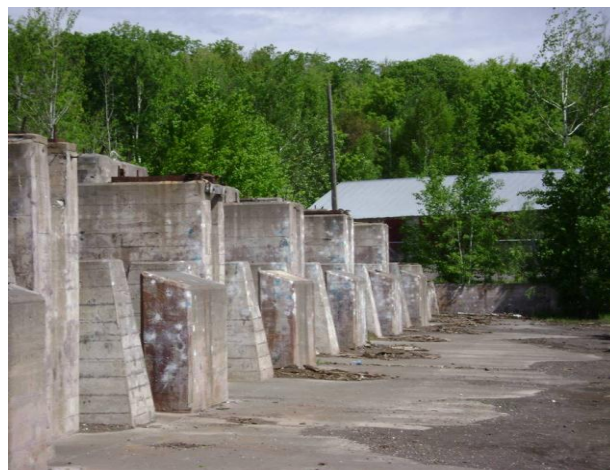
Figure 7: Ruins at Mason with paintball marks, picture taken July 2008 (MDCH).