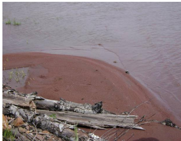
Figure 3: Stampsand along the shore of Torch Lake near the Lake Linden Village Park beach, picture taken July 2008 (MDCH)