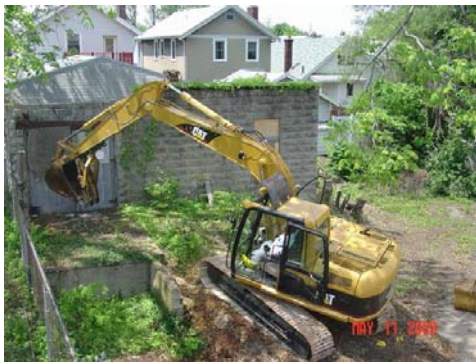
Site Building.