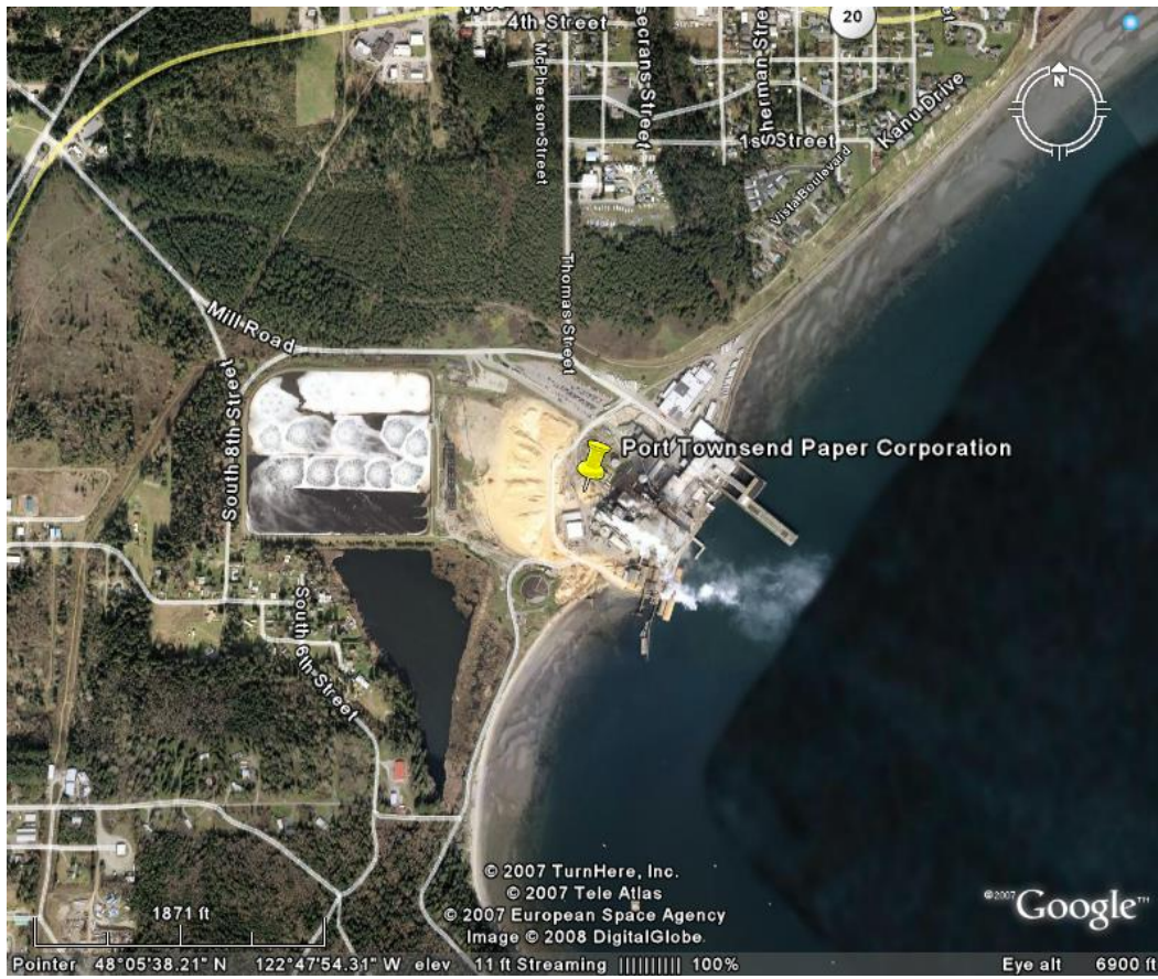
Figure 1. Port Townsend Paper Mill, Jefferson County, Washington