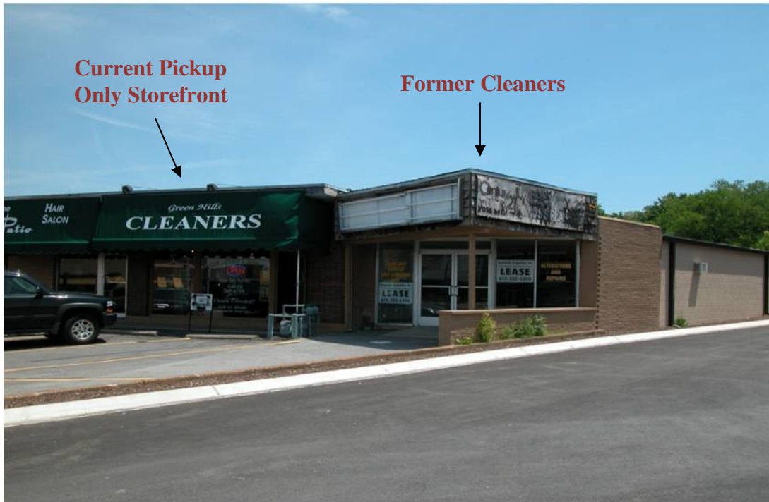
FIGURE 2 - View of retail establishments at the northern end of the shopping center, near the former cleaner location.